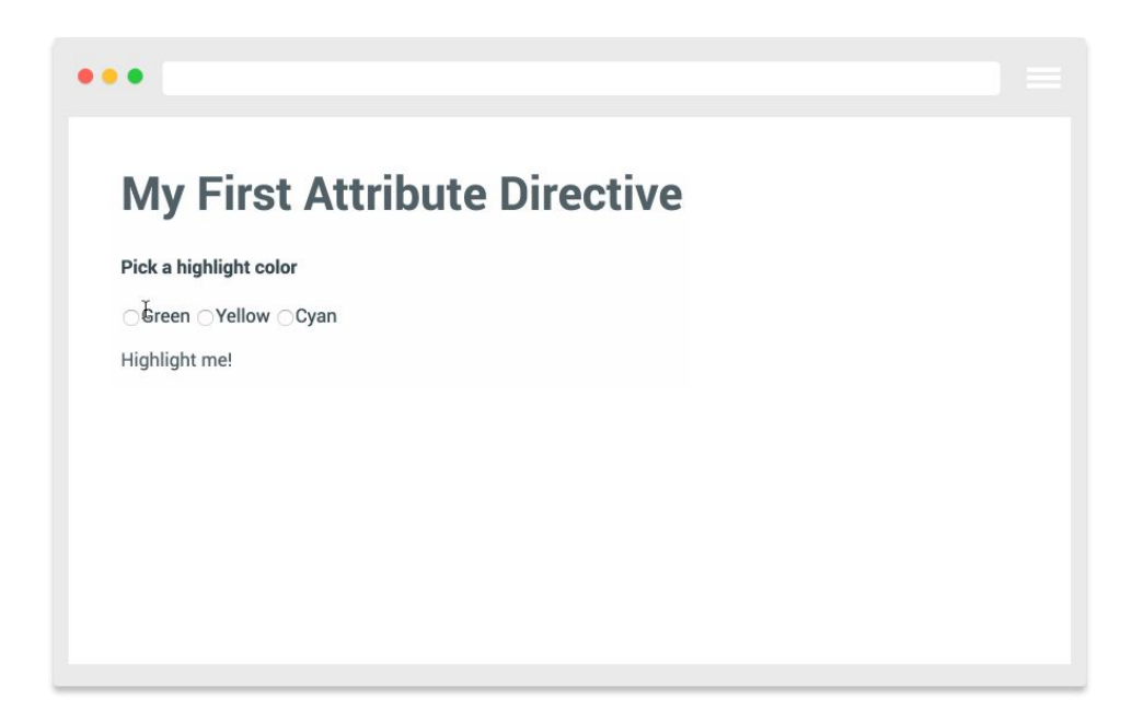
Figure 3.0 - Image (.gif) with Browser Background Template Example